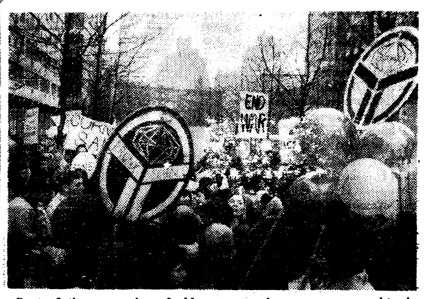
Part of the procession of old, young, and very young people who demonstrated for world disarmament last Saturday.

A fifty year old fruit seller asked, "Who are all these people?"